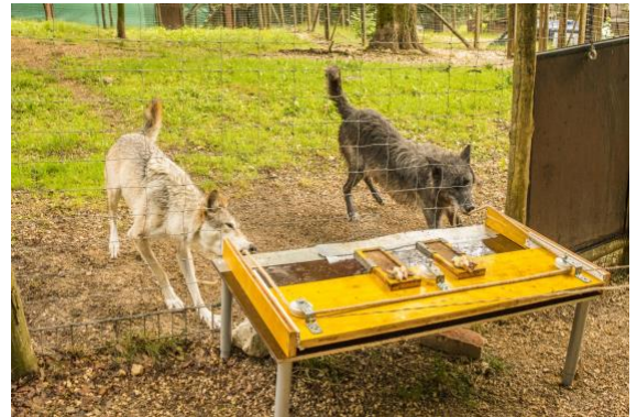
table has a rope running through it. Two animals have to pull at the same time to pull it forward. If just one pulls, the rope comes out and no snack for them. This experiment was conducted hundreds of times with different pairings of wolves and dogs. Of 416 attempts, wolves cooperated and got the reward 100 times. Of 472 attempts, dogs got the reward 2 times. This experiment is confirming that our cultural image of wolves as

Our second example of cooperation is of wolves. Earlier I used the expression "Humans are wolves to other humans." The expression is based upon the image of wolves as predatory and cruel. Famed primatologist and ethologist Frans de Waal said that the expression is an injustice against canids who are among the most gregarious and cooperative animals on the planet. After all, he noted the cooperative and social qualities in wolves is what prompted humans to domesticate them and produce dogs. 6 The picture here is from an animal behavior experiment in Austria. 7 That